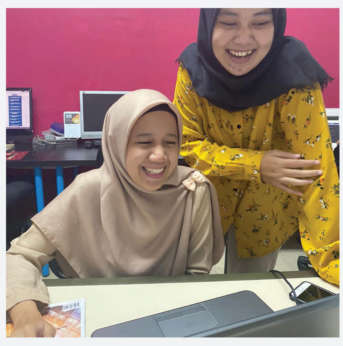
Warta Ekonomi Editorial Room