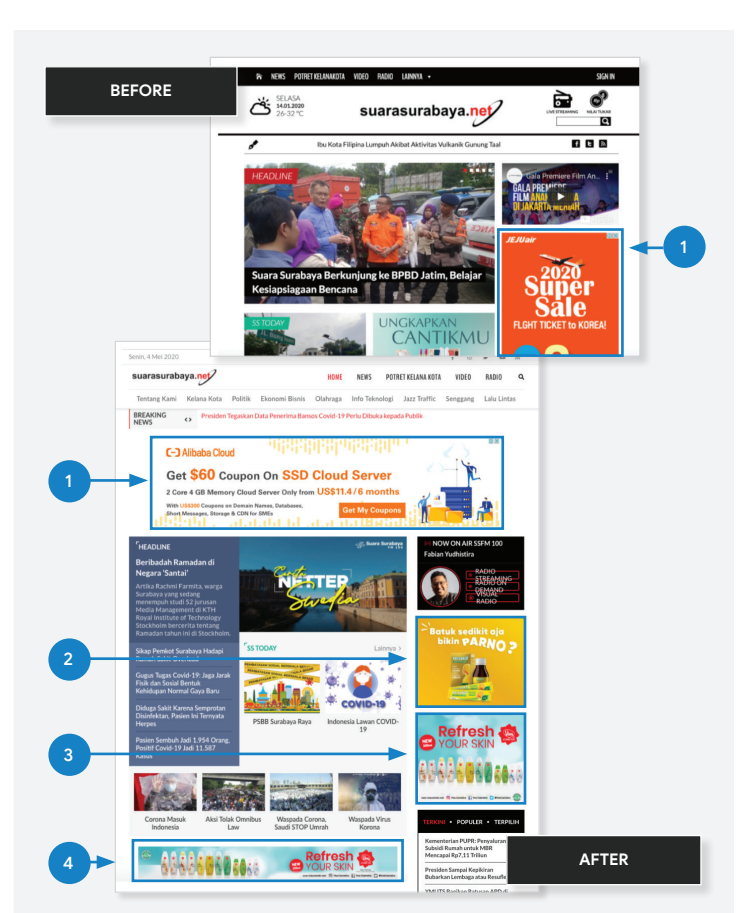
Increasing the number of Ad Slots used helped Suara Surabaya double their digital Ad Revenue within 2 months